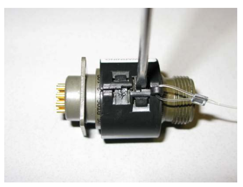
Figure 4: Push down on the latch.

1. Use a screwdriver to push down on one of the lockout clip latches as shown in Figure 4.