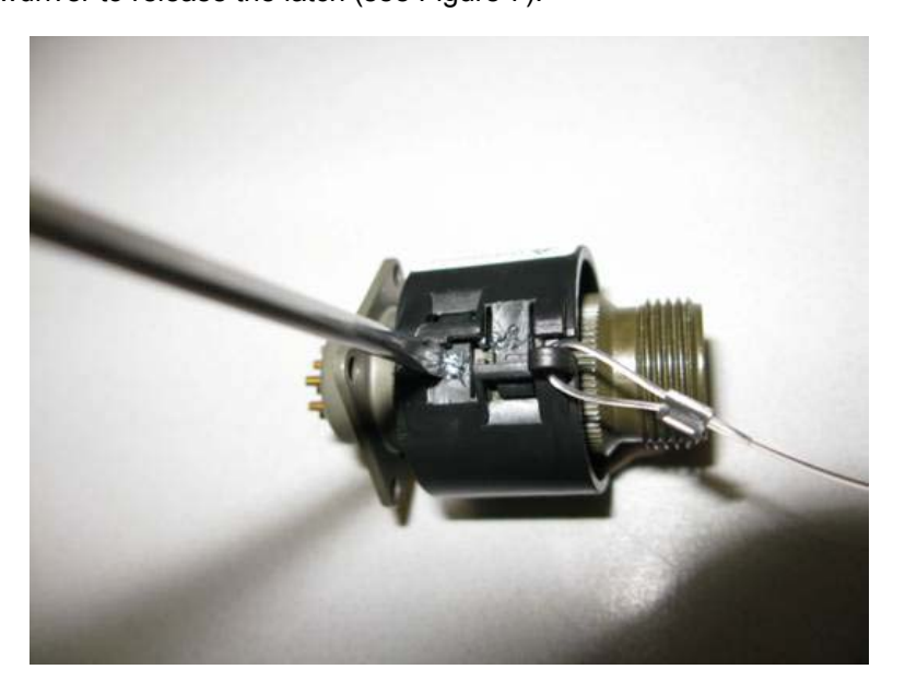
Figure 7: Twist the screwdriver.

4. Twist the screwdriver to release the latch (see Figure 7).