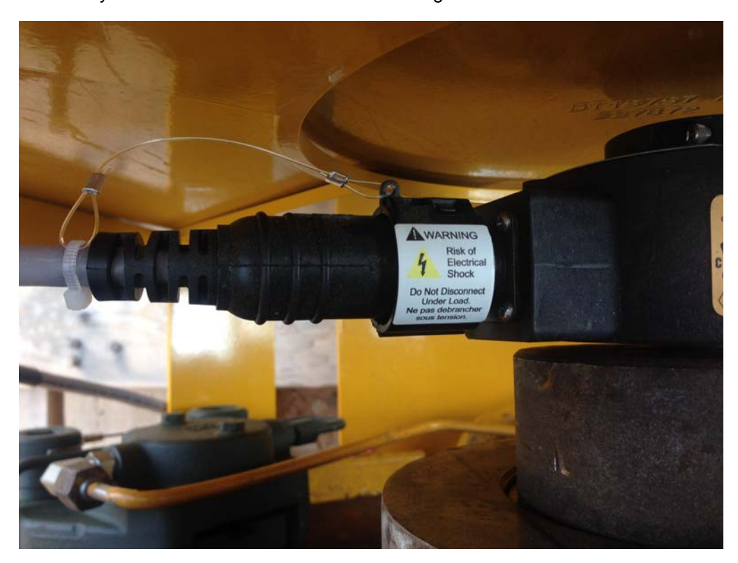
Figure 3: Encoder cable with lockout clip installed.

3. Connect the lanyard to the encoder cable as shown in Figure 3.