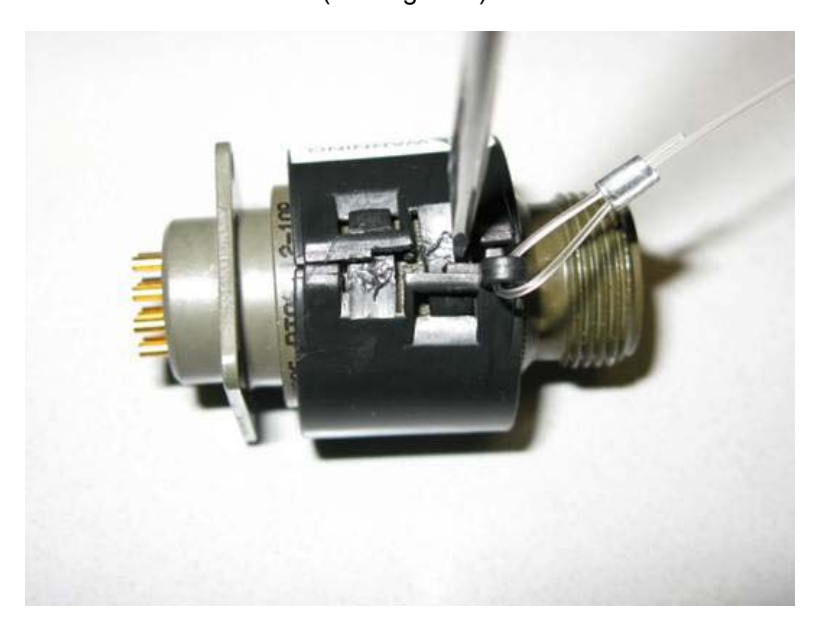
Figure 5: Twist the screwdriver.

2. Twist the screwdriver to release the latch (see Figure 5).