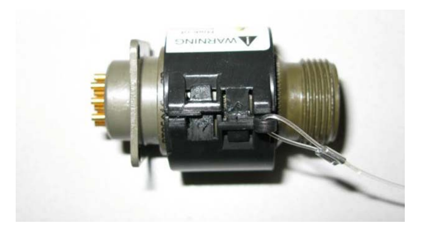
Figure 2: Close the lockout clip.

2. Close the lockout clip (see Figure 2).