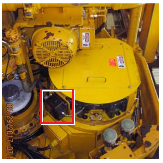
Figure 2: Encoder J-box Location 2